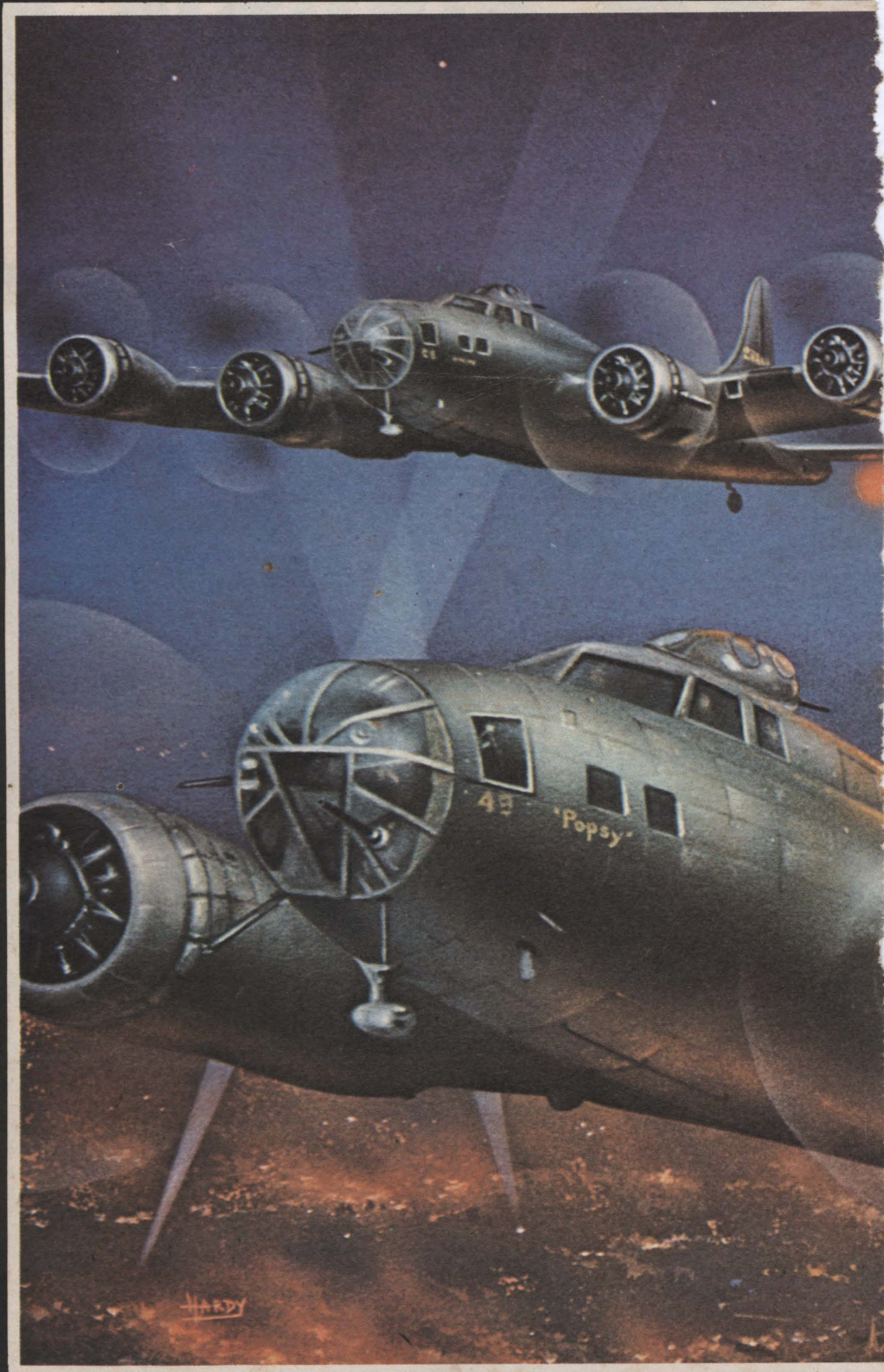
At the tail-end of a squadron of super-fortresses returning to base after a bombing raid on a German city, two B-17's find themselves playing a bizarre game of 'tag' with a formation of foo-fighters.

In 1873 a tremendously fast-moving UFO circled the town of Bonham, Texas. This was a daylight event in summer time, yet the high speed of the object was such that its shape is uncertain; it may have been globular or even